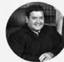
Judge Carlos Rodriguez