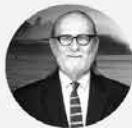
Judge Tom Lynch