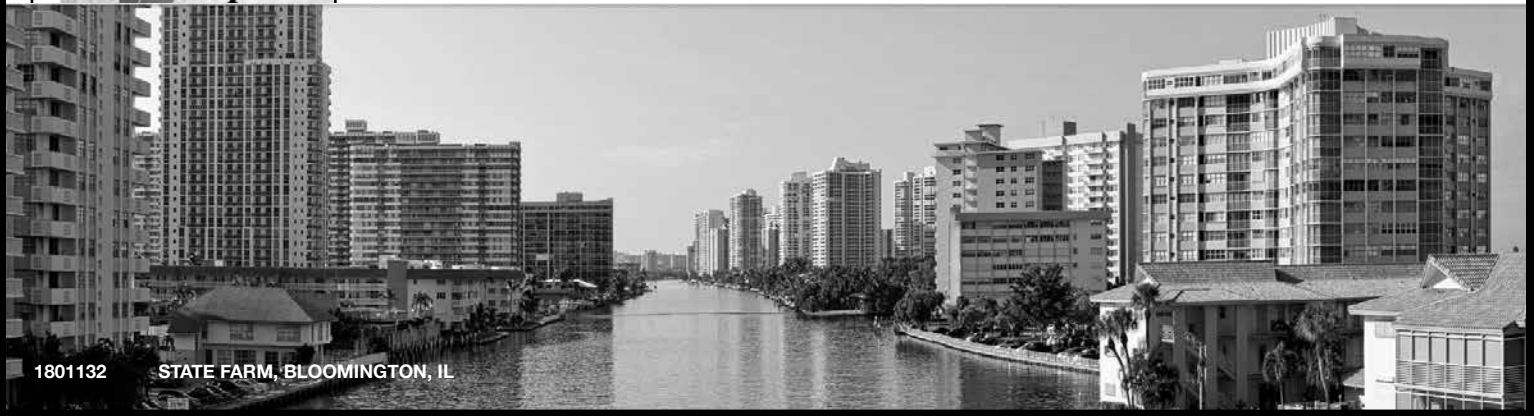
1801132 STATE FARM, BLOOMINGTON, IL