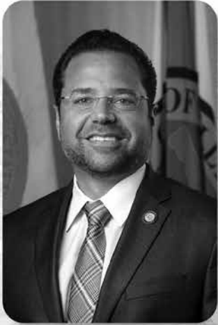
City of Hollywood Mayor Josh Levy