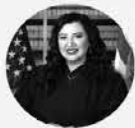
Judge Elaine Carbuccia

FEBRUARY 25 10 AM - 12 PM RSVP REQUIRED BY FEBRUARY 23 AT 12PM